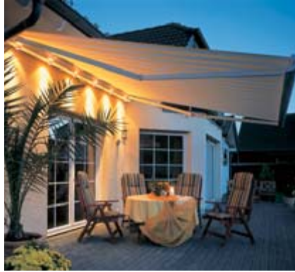
... your Lux lightbar patio lighting ...