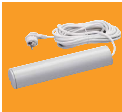
WeiTronic Combio-868 HD 1.5 KW in a fancy bar.

Whichever WeiTronic radio receiver you choose to control your awnings or the Tempura heating system, it can be mounted +outdoors and out-of-sight. You benefit in that you only need to replace the receiver and not the entire motor if the device needs servicing. At the same time, since the WeiTronic system is compatible with the Elero remote control system, it can be used for a broad range of applications.