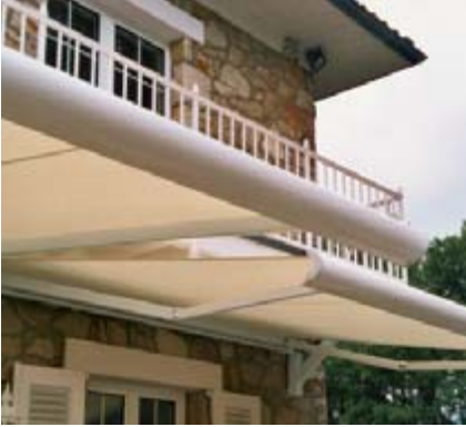
Control your awnings using remote control technology ...